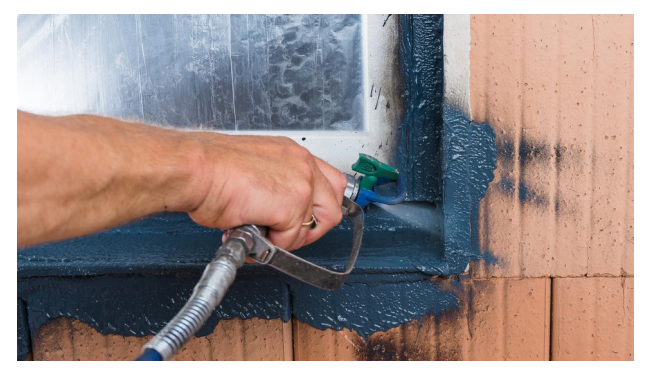
8. Spray over AEROSANA FLEECE

AEROSANA VISCONN is also suitable for use in forming sub-sill flashing. To do this, first spray the insulation angle fillet in a generous manner.