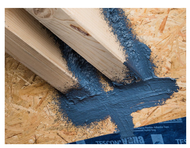
9. The finished joint at a double collar tie penetration

Areas that are difficult to access can also be sealed conveniently using the spray method.