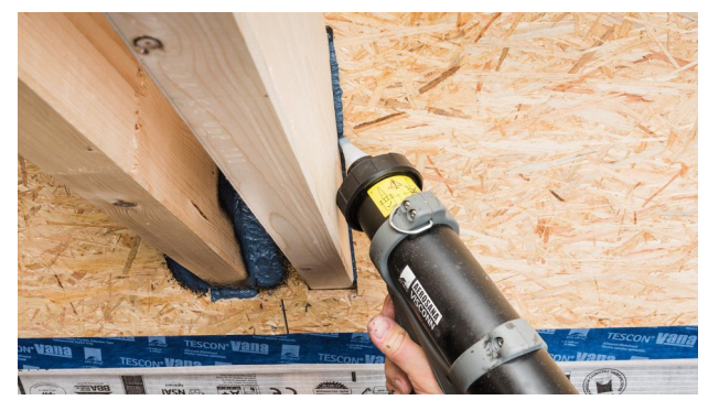
5. Fill the joint

Fill the joint with a sufficient amount of AEROSANA VISCONN / FIBRE.