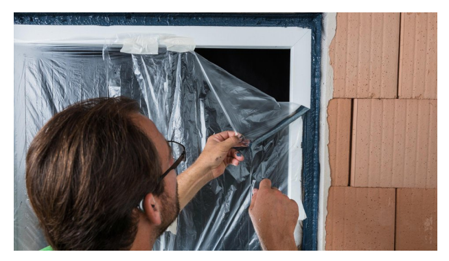
9. Remove the protective sheeting

Insert the AEROSANA FLEECE into the still-wet AEROSANA VISCONN spray film, ensuring there are no folds or creases. Carefully finish any corners or raised edges.