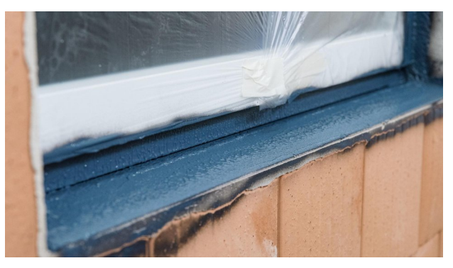
6. Pre-spray the sub-sill flashing

Remove the stuck-on protective sheeting before AEROSANA VISCONN dries.