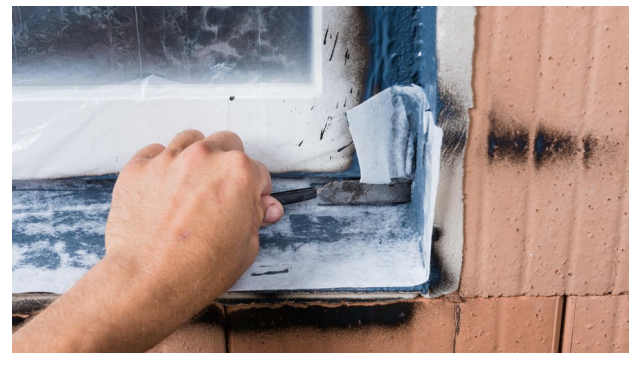
7. Install the AEROSANA FLEECE sub-sill flashing

Check the required wet layer thickness of 500 \mu\text{m} using a suitable gauge.