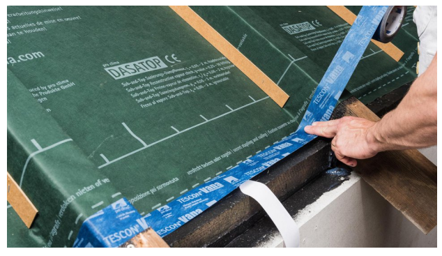
7. Stick the joint

After the sealant has fully dried, seal the refurbishment vapour check in an airtight manner using TESCON VANA, for example.