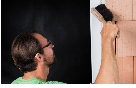
2. Clean the subsurface

Insert the insulating material (loose wool, loose hemp) into the window joint in such a way that is flush with the window frame. Cut away protruding foam after it has hardened.