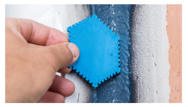
5. Check the layer thickness

Check the required wet layer thickness of 500 \mu\text{m} using a suitable gauge.