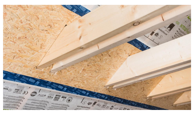
1. Initial situation