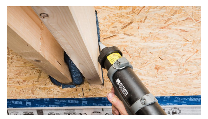
5. Fill the joint Fill the joint with a sufficient amount of AEROSANA VISCONN / FIBRE.