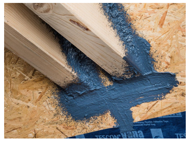
9. The finished joint at a double collar tie penetration

Areas that are difficult to access can also be sealed conveniently using the spray method.