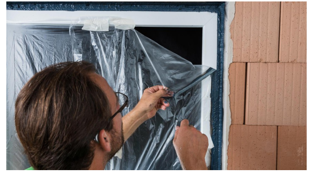
9. Remove the protective sheeting Remove the stuck-on protective sheeting before AEROSANA VISCONN dries.