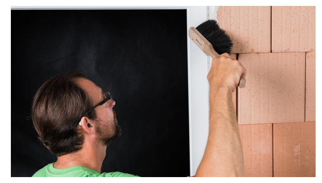
2. Clean the subsurface

Insert the insulating material (loose wool, loose hemp) into the window joint in such a way that is flush with the window frame. Cut away protruding foam after it has hardened.