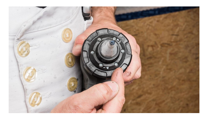
4. Set the device Set the AEROFIXX to line application.

Gaps of up to 3 mm can be filled using AEROSANA VISCONN. Use AEROSANA VISCONN FIBRE for wide gaps of up to 20 mm (7/8"). In this case, the gap must be filled with sealant to a depth of at least half the width of the gap.