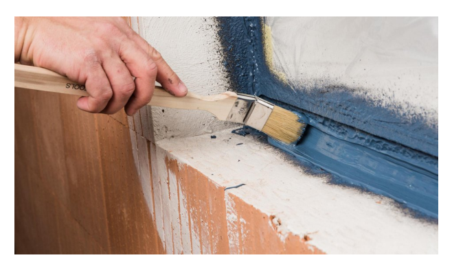
7. Check the joint

If necessary, seal any gaps with a brush and AEROSANA VISCONN / FIBRE.