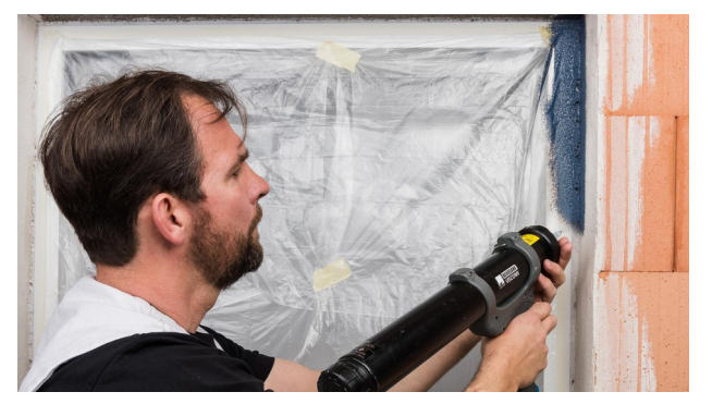
5. Spray on the sealant

Spray a sufficient amount of AEROSANA VISCONN / FIBRE onto the window frame, the joint insulation and the adjacent masonry. Apply the sealant evenly. Cracks and pores must be closed by flooding them. The layer thickness is sufficient when a textured surface ('orange peel') is recognisable.