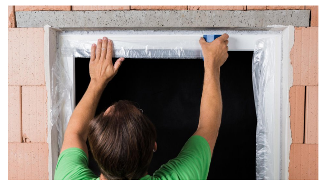
3. Protect the window with sheeting

Protect the panes of glass and visible parts of the frame against soiling by using masking tape.