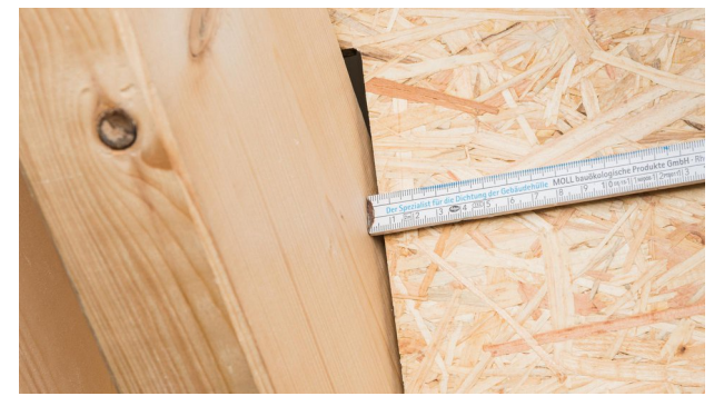
3. Check the joint width

Brush off subsurfaces; if necessary, clean with a vacuum cleaner and wipe down.