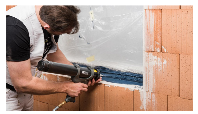
6. Continue around the rest of the window

Alternatively, remove the joint insulation to a sufficient extent to create a clean surface for a lateral bond to the side of the window frame.