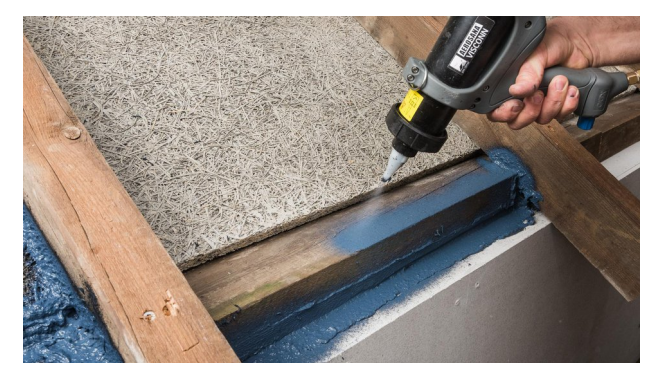
6. Use as a primer

Switch the AIRFIXX to line application and completely fill the gap (in this case, between the wallplate and the knee wall) with AEROSANA VISCONN / FIBRE.