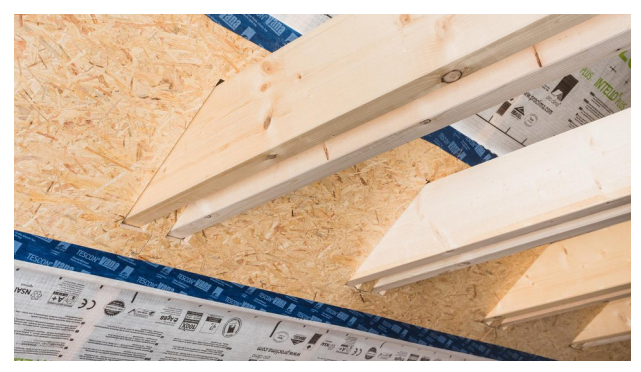
1. Initial situation