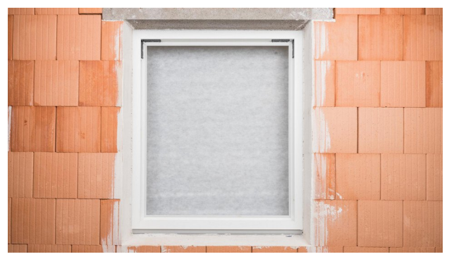
1. Initial situation

Window is installed, window joint has been filled with insulation material.