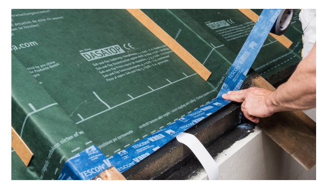
7. Stick the joint

After the sealant has fully dried, seal the refurbishment vapour check in an airtight manner using TESCON VANA, for example.