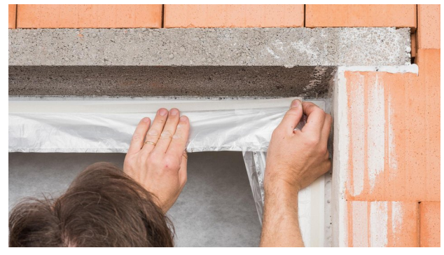
4. Apply masking tape to the window frame

Brush off subsurfaces; if necessary, clean with a vacuum cleaner and wipe down.