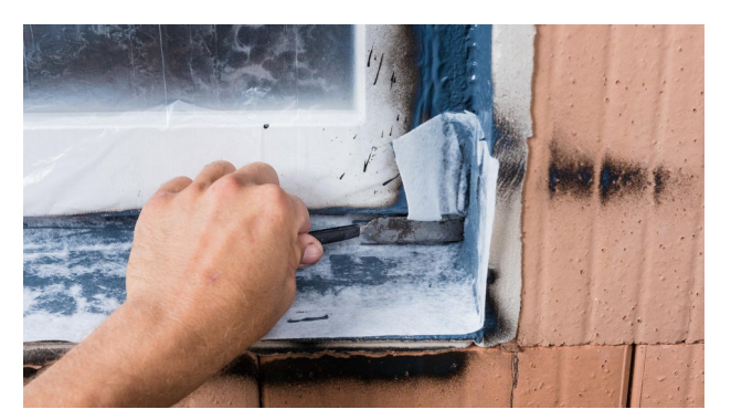
7. Install the AEROSANA FLEECE sub-sill flashing Insert the AEROSANA FLEECE into the still-wet AEROSANA VISCONN spray film, ensuring there are no folds or creases. Carefully finish any corners or raised edges.

Check the required wet layer thickness of 500 \mu\text{m} using a suitable gauge.