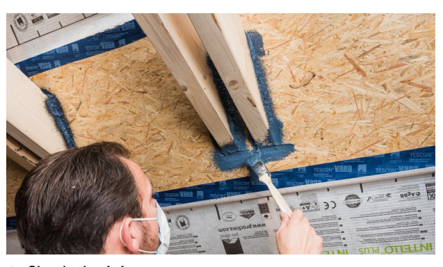
8. Check the joint If necessary, seal any gaps with a brush and AEROSANA VISCONN / FIBRE.