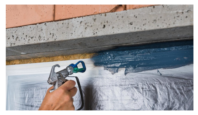
4. Spray the lintel and reveals Apply the required layer thickness of AEROSANA VISCONN in one or two spraying steps.

Protect the panes of glass and visible parts of the frame against soiling by using masking tape.