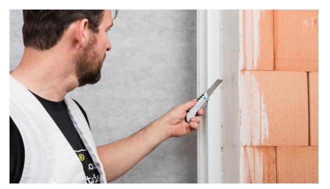
3. Cut away any excess insulation material If necessary, cut away any protruding insulation.

Window is installed, window joint has been filled with insulation material.